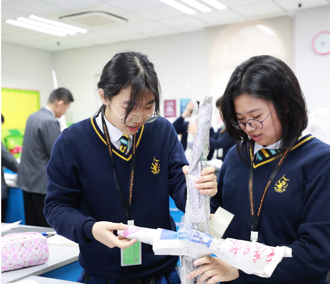
入学要求 Entry requirements

为了让学生顺利开展我校课程教学，我们对学生的以往表现设定了最低要求。所有申请高中部的学生都将由高中部主任或招生办面试，并参加一系列入学考试。此前参加过GCSE考试的学生应在不少于5门GCSE课程（含数学、英语或英语为第二语言）中取得5分及以上的成绩。为学生顺利开展A Level课程学习，我校更青睐取得6分及以上成绩的学生。