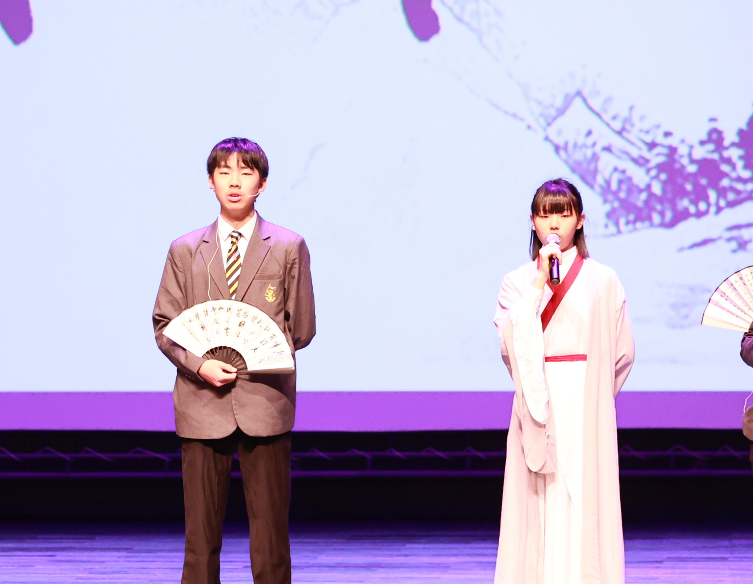
A Level预备课程科目 Pre A Level subjects