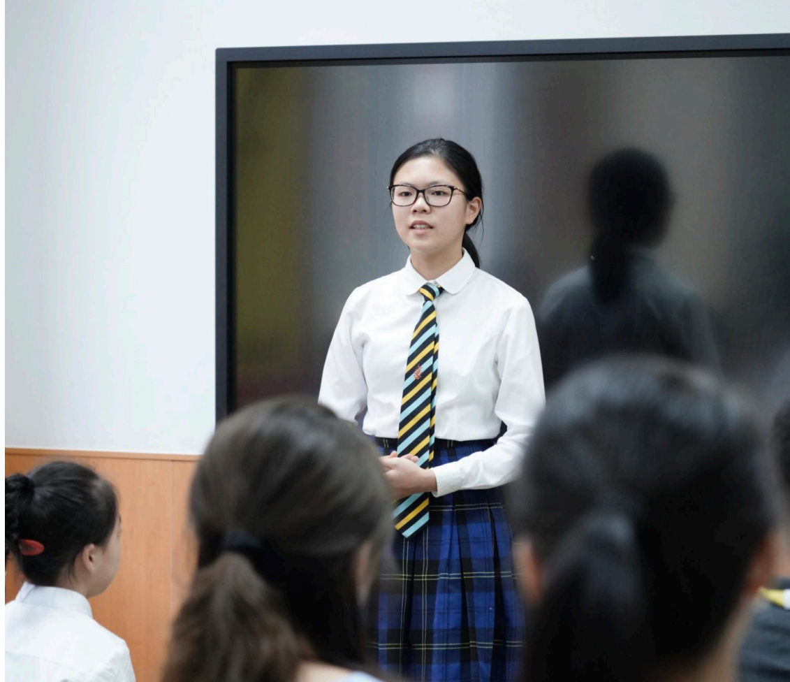
学生领导力 Pupil leadership

惠灵顿杭州校区是一个充满活力的学习社群。我们为学生及其取得的成就感到无比自豪，这也正是惠灵顿社群的核心所在。惠灵顿学子有求知欲，积极把握机会，关爱他人，为自己和他人的成就而感到快乐；在进入更广泛的社会后，他们富有同理心，深深地以惠灵顿及其所代表的一切为荣。