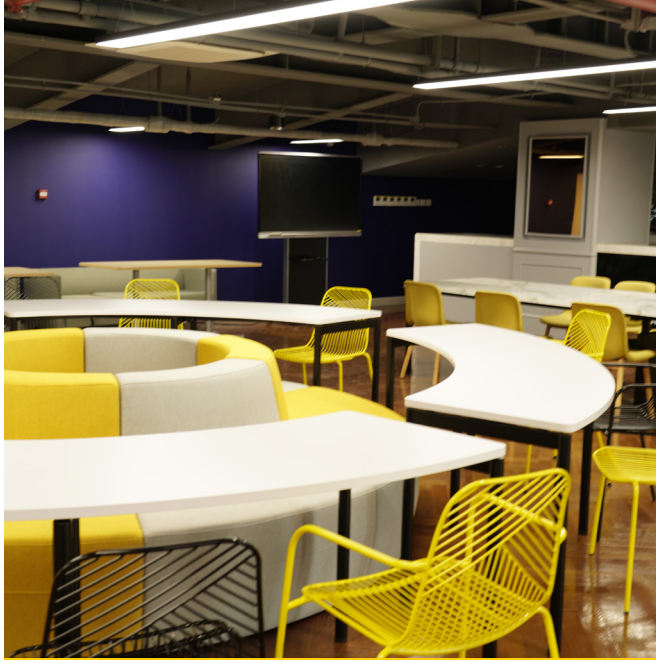
高中部中心 The Sixth Form centre

高中部中心是一片全新装修的专门区域，内部设施完备，为学生打造出舒适的学习环境。学生既能坐在高脚桌旁开展小组学习，也能在个人学习室学习。校区提供稳定快速的无线网络全覆盖。每位学生都有一个储物柜。